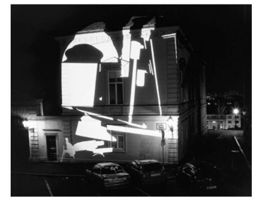
Goran Petercol, Flashes , projection from the Museum of Contemporary Art Zagreb onto the Dverce Palace, Zagreb, Croatia, 2005

The same artist photographed objects at the Museum of Contemporary Art Zagreb, using flash. He then extracted the shadows and projected them as individual light forms along with other forms of light.