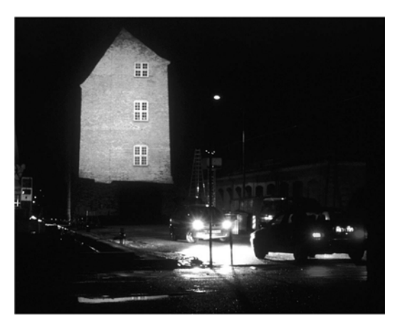
Blocs, projection on Masterkranen, project for Lux Europae, Copenhagen, Denmark, 2001

symbolic significance. She produced an empty, 5-metre long cuboid emitting white light (from fluorescent tubes) in a sequence of billboards rented for advertising along the fence of the balcony, which runs along two of the building's façades. Its starting point was the observation that billboards in busy public spaces have become the second skin of the building (façade). They are located in places that we pass by and we glance at them unaware. They use images and messages that trigger certain flows of thought. They close up architecture (which thus becomes invisible) and open up a different space - that of manipulation (through perception). An empty lighted billboard (resembling installations by Robert Irwin) halts for a moment the automatism of consuming images. To be sure, it opens up space by following the same principle - imposing itself on the spectator with its placement, format, and intense illumination; nevertheless, it remains open in terms of content (since there is no particular image/message). According to the author, halting the imposed flow of associations (the balcony fence) creates an opportunity (conditionally) of triggering a free flow of associations/thoughts, projecting a possible individual content; at least it momentarily halts the process and communicates the absence of all content. If today "the living room is rhythmicized on the street," then the building's façade represents the interior walls of that external room.