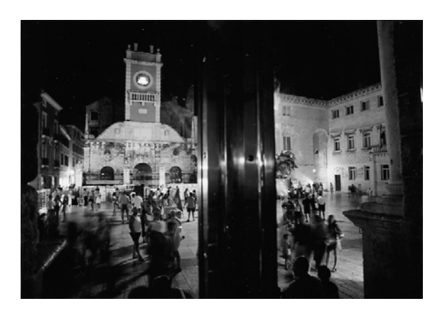
Darko Fritz for space=space project, Zadar City Square/Closed Circuit City, Zadar, Croatia, 2001

In the project called Zadar City Square, the video image showing the actual situation is obtained from a camera placed on a lantern above the central point of the city square, while the real space and events in it are directly juxtaposed with their representations projected along the marginal, defining architectural surfaces, which are used as projections screens – the inner wall of the renaissance loggia, seen from the outside through a glass façade, and the milky glass that replaces the mechanism of the old city clock, which had been extracted from the tower for restoration purposes ten years before.