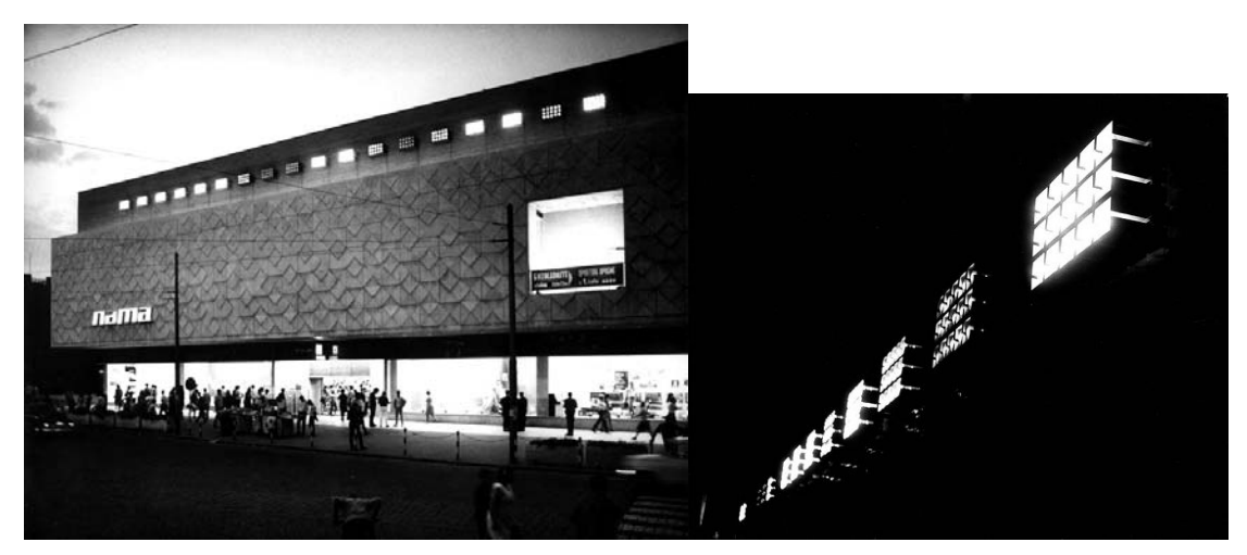
Vladimir Bonačić, DIN. PR 17, NaMa, Kvaternik Square, Zagreb, 1969 / part of the Tendencies 4 exhibition, organized by the Gallery of Contemporary Art Zagreb, Croatia

As a way of democratizing art in the age of the first commercial light ads in socialist Yugoslavia, the display on the façade of Na-Ma (People's Store) department store included a computer-generated light installation that emitted a light-show based on a mathematical algorithm. At that time, the square was rather dark at night and the 36-metre long installation also served as additional public lighting.