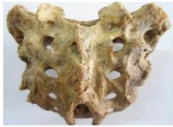
Fig.3: Inverted U shaped sacral hiatus