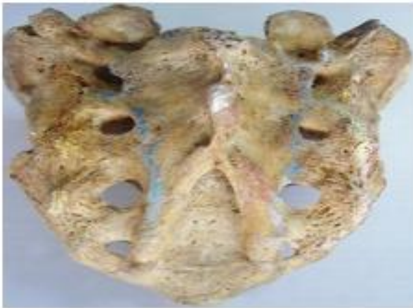
Fig. 2: inverted V shaped sacral hiatus