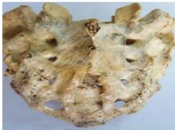
Fig.4: Irregular shaped sacral hiatus

The average length of sacral hiatus was 29.5(9.5) mm (range 17-49mm). The length of sacral hiatus mostly between 17-30 mm. The average width of sacral hiatus (sacral cornua) was 16.2 (2.7) mm (range 10-22 mm). The distance between the right superio lateral sacral crest and the sacral apex was 61.4(11.2) mm (range 36-88 mm). The distance between the left superio