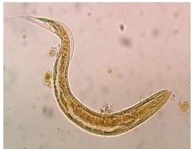
Fig.2: Stool specimen showing rhabditiform larva of Strongyloides stercoralis