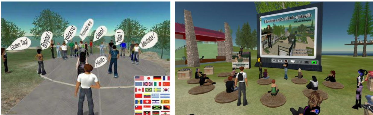
Figure 3. Scenes from Second Life

The online virtual reality 3D-chatting-game Second Life (see Figure 3) provides an enjoyable and interesting option for the FL learners (see Salmon, 2009 for details). They can meet many individuals from all over the world who are there for chatting. So, this setting makes the writing and reading activities more authentic and natural when compared to the artificial writing tasks urged in the traditional courses. Moreover, learners find the opportunity to improve their FL writing skills while exchanging fresh and daily information with others about the things they read in the texts. Among many possible ways in which Second Life (SL) can be consulted and used for FL learning, throughout this course it was utilised in the simplest possible way to avoid it become a burden for the students, but rather to be approached just as a game.