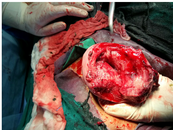
Figure 2 Uterine ruptured at fundus

The patient recovered well with no postoperative complications. She was discharged, and was asked to be regular for a follow-up. The patient's current condition was explained to her. As she was willing for tubal ligation, her ligation was done.