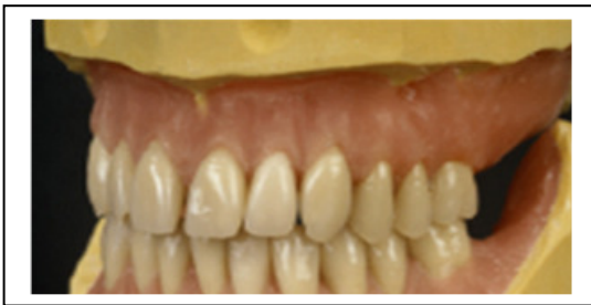
Fig.3 Stippled upper complete and lower partial denture