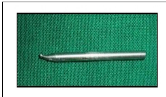
Fig. 4 Offset bur for stippling