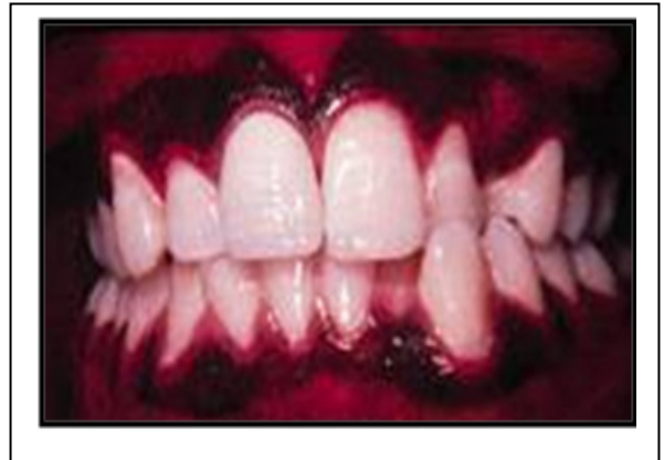
Fig. 6 Soft tissue shade guide