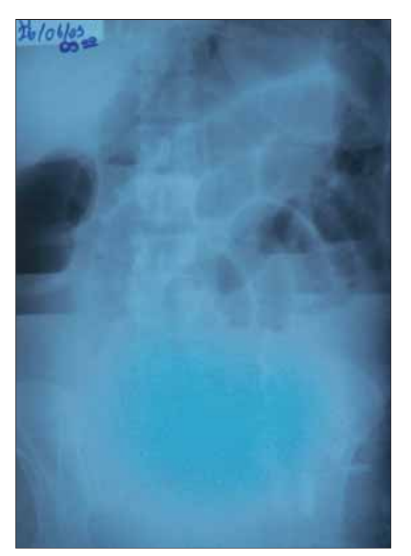
Figure 1: Plain abdominal radiography revealing multiple air-fluid levels.

cyclophosphamide 500 mg were administered and repeated every 2 weeks for 3 months. Azathioprine 2 mg per kg daily was initiated. Some abdominal symptoms such as nausea, dysphagia and constipation were started when she was taking azathioprine and prednisone. She suffered from chronic constipation despite regular use of laxatives and required repeated hospital visits for rectal enema. The azathioprine was switched to 750 mg MMF twice a day and oral prednisone 5 mg daily. She remained asymptomatic with complete resolution of GIS vasculopathy during 7 months of follow-up. However, she showed signs of recurrence of digestive symptoms while she was taking MMF 750 mg twice a day and prednisone 5 mg daily. Intravenous cyclophosphamide at a dose of 750 mg every 3 months for 12