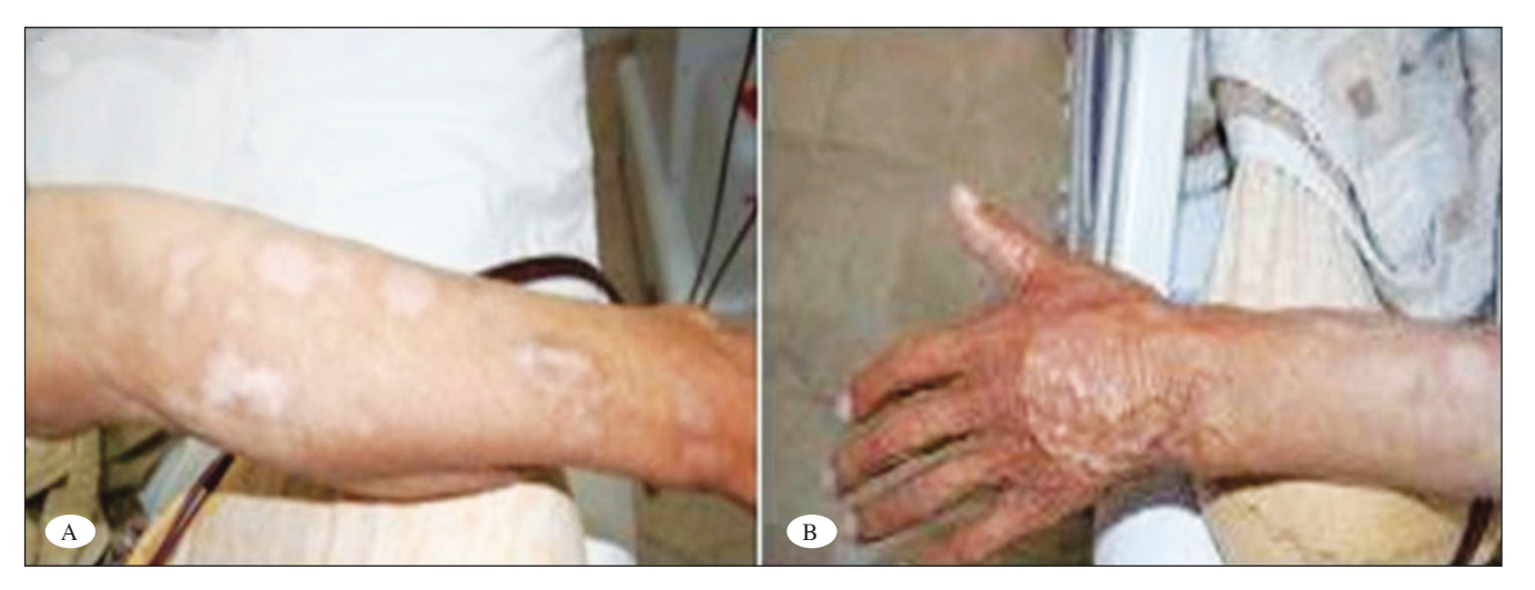
Figure 2 A-B: Full recovery was achieved in the left arm eighth months after the successful repair of brachial pseudoaneurysm and appropriate dermal greft application.

problems ranging from limb loss to life-threatening conditions and should be controlled immediately for these kinds of risks (2,4). In this study, we aimed to present a case with extremity-threatening pseudoaneurysm that causing vascular access during hemodialysis.