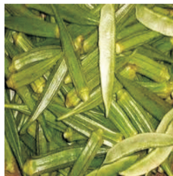
Infected Fruits of Bhendi