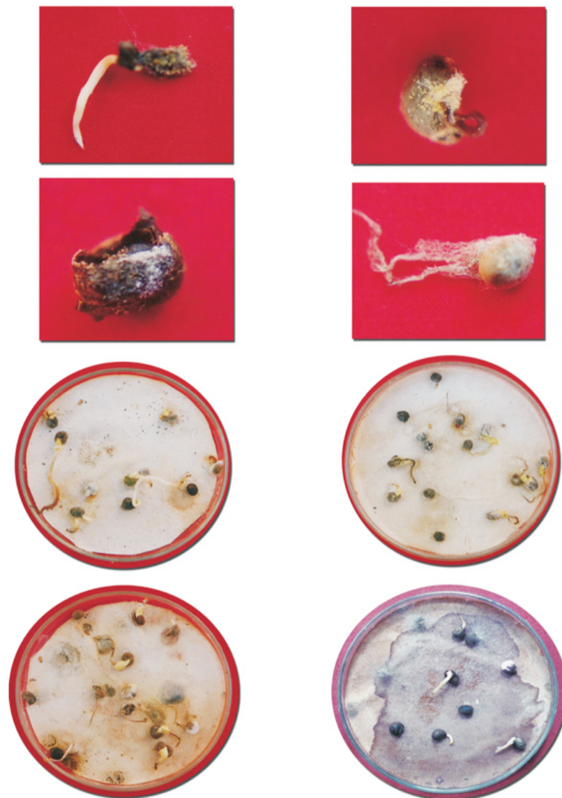
Plate-19 : Incidence of mycoflora on the seeds of Bhendi ( Abelmoschus esculentus (L.) Moench)