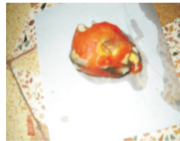
Infected Fruits of Tomato