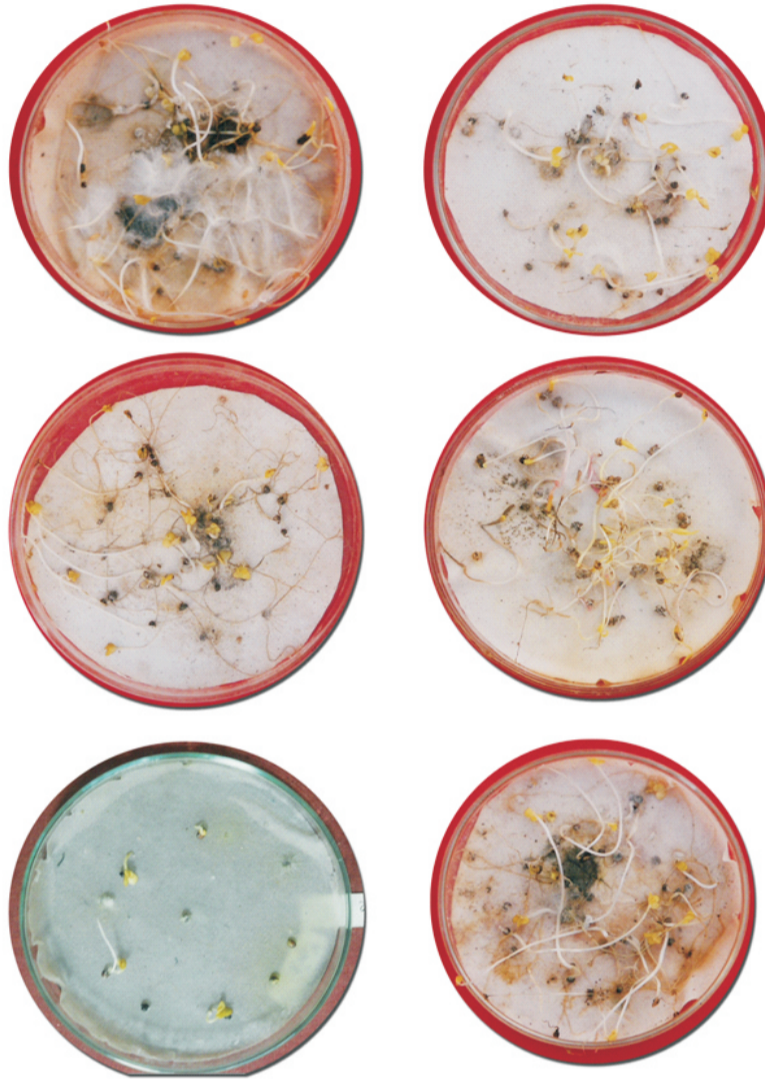
Cabbage ( Brassica oleracea var. capitata L.)