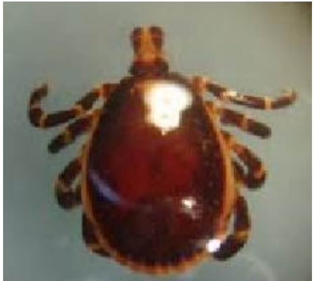
Figure 2. Hyalomma aegyptium (dorsal-male).