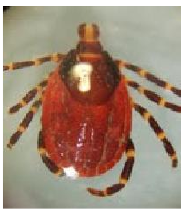
Figure 3. Hyalomma aegyptium (dorsal-female).