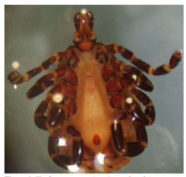
Figure 4. Hyalomma aegyptium (ventral-male).