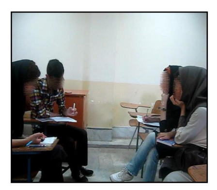
Figure 1. Provision of DIU.

The silence is a very important component of a DIU, especially in writing conferences. As Koshik (2008) illustrates, when the learners complete the utterance, teachers evaluate their responses; thus, DIUs are generally treated as question-answer sequences. If the learner is not provided with enough time to think (line 5), the DIU may not result in a successful revision on the text.