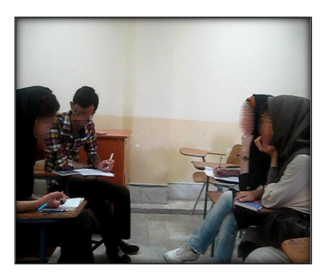
Figure 2. The learner gazing at the paper.