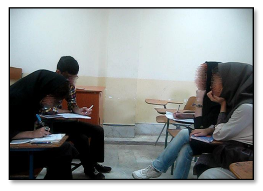
Figure 3. The learner writing the revision.