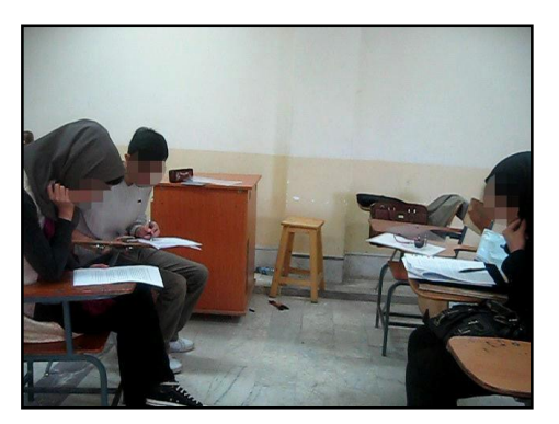
Figure 6. The learner gazing and thinking.

In this extract, the silence also served as a room in which the learner could think about the question asked in the conference and also prepare to answer the question.