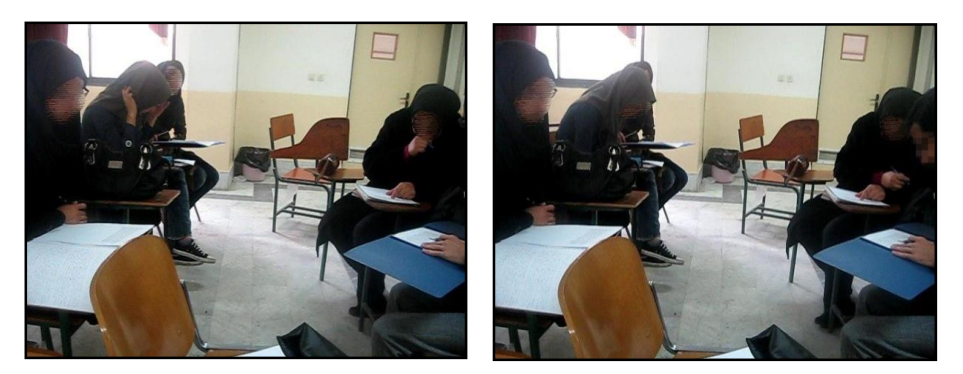
Figure 4. Silence; the learner bends towards draft.

The silence can be considered as one of the crucial elements of the learner's successful revision in writing conferences. As Rowe (1986) states, it is difficult for many teachers to reach an average wait time up to 3 seconds or longer. She further suggests that if teachers succeed in reaching this average, "there are pronounced changes in student use of language..." (ibid., p. 43). Accordingly, the appropriate use of wait time by the teacher (line 35) can be considered as a key in the participation, first and foremost, and also the right answer made by the learner.