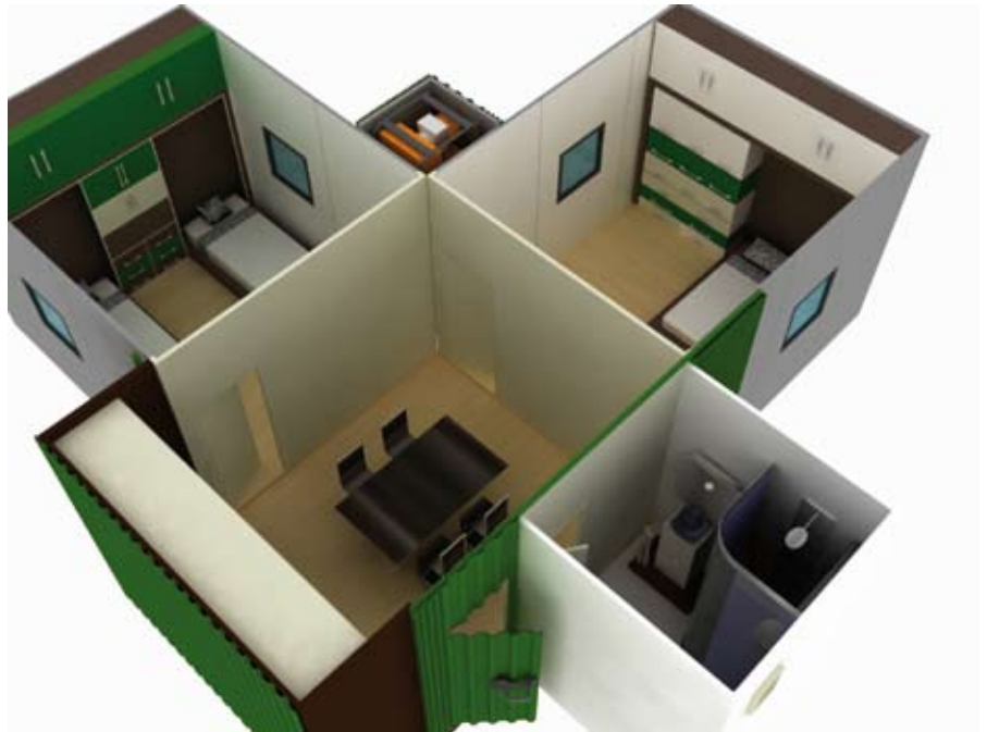
Figure 1. General View of the “BoX in BoX Temporary House.”