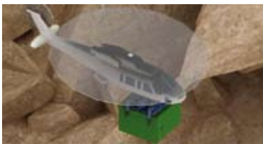
Figure 6. Transportation Step of the “BoX in BoX Temporary House.”