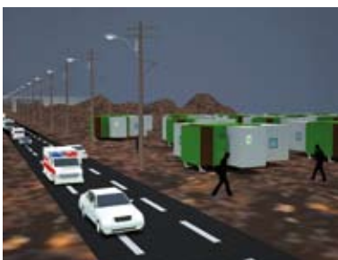
Figure 7. “BoX in BoX Temporary House” Settlement Area.