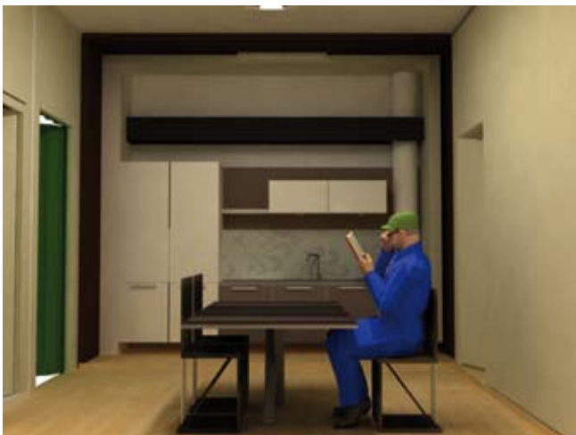
Figure 4. Interior Furnishing of the "BoX in BoX Temporary House."