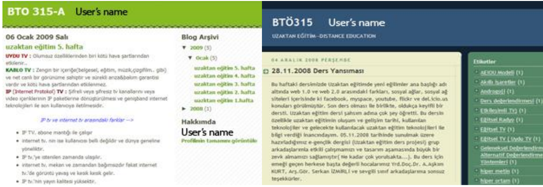
Figure 1 Personal blog samples