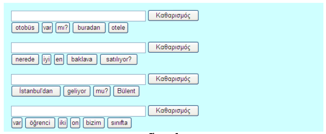
Figure : 6 A phrase puzzle exercise

Furthermore, in Turkish language the verbs "to be" and "to have" do not exist. Word order is important in Turkish language, whereas in Greek language word order is not of great importance (Millas, 2008). This different structure seems to become a major difficulty to Greek and other European learners of Turkish language and may explain the popularity of this activity.