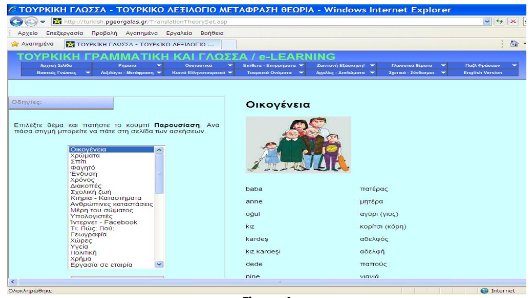
Figure: 4 Learning Turkish vocabulary-The theoretical part

and fill in) were collected for a period of 6 months.