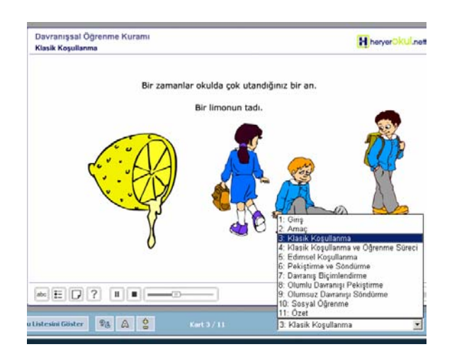
Figure: 2 A screen-shot from classical conditioning

Teachers also had some technical problems. Internet Explorer pop-up blocker warning was new for them. They couldn't solve it. Therefore, they preferred to call computer teachers. Most of them overcame the problem by the help of computer teachers.