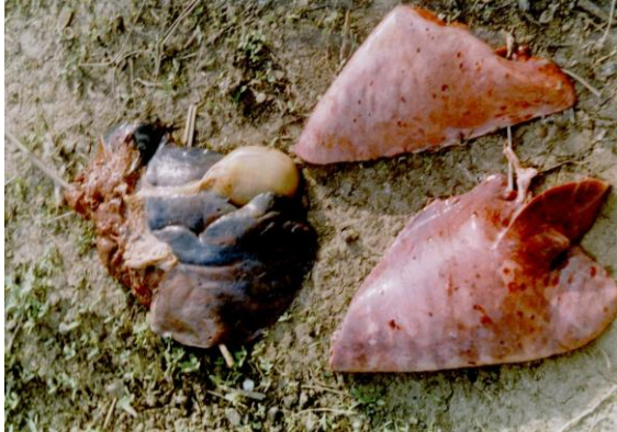
Figure 1. Viscera from a goat - haemorrhages.

Şekil 1. Bir keçiye ait iç organlar - hemorajiler.