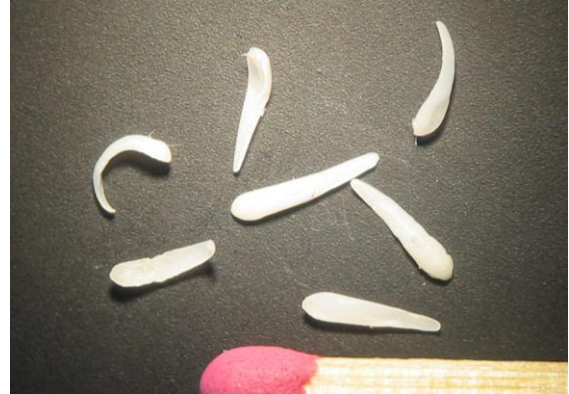
Figure 2. Isolated Pentastomum denticulatum parasites.

From each animal, 10 parasites were isolated, stored in 70° ethanol and examined in the laboratories of the Parasitology and Invasive Diseases Unit at the Faculty of Veterinary Medicine, Trakia University, Stara Zagora. Examination of the specimens was performed natively using a stereoscope Stemi 2000-C (Zeiss, Jena), and after clearing with lactic acid, on an Axioscop microscope (Zeiss, Jena). The isolated parasites were white in colour with elongated oval dorsoventrally flattened bodies, with convex dorsal surface while the ventral one was slightly bent inward. They were wider in their anterior end, becoming gradually narrower towards the back end. Their dimensions were: length of 5-6 mm and width of 1-1.6 mm (Figure 2). The parasite's entire body was divided into 80-90