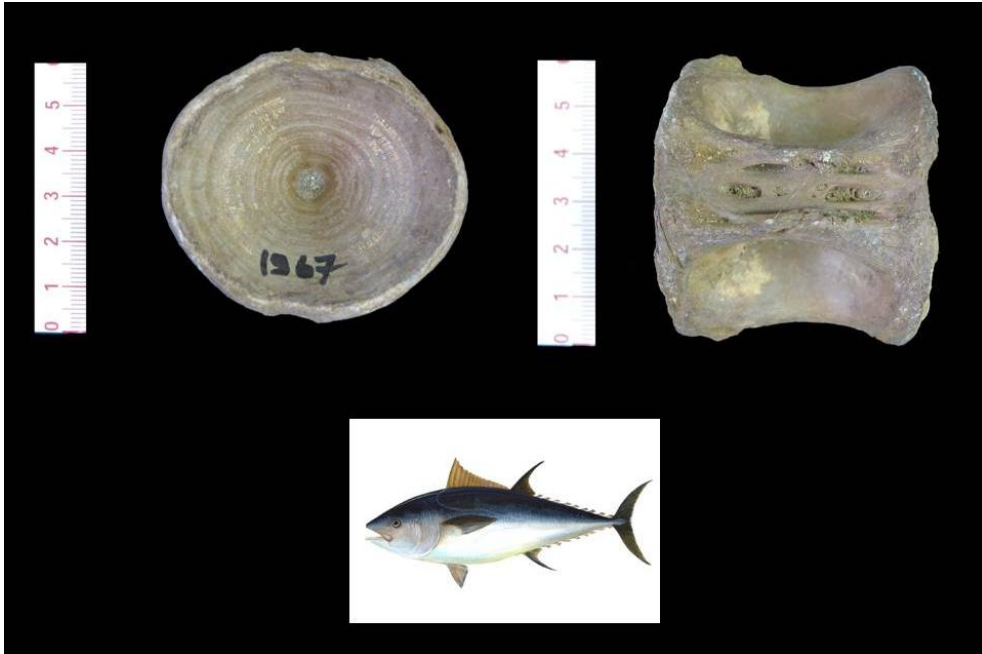
Figure 4. Tuna ( Thunnus thynnus L.) remains unearthed from the Metro and Marmaray excavations.