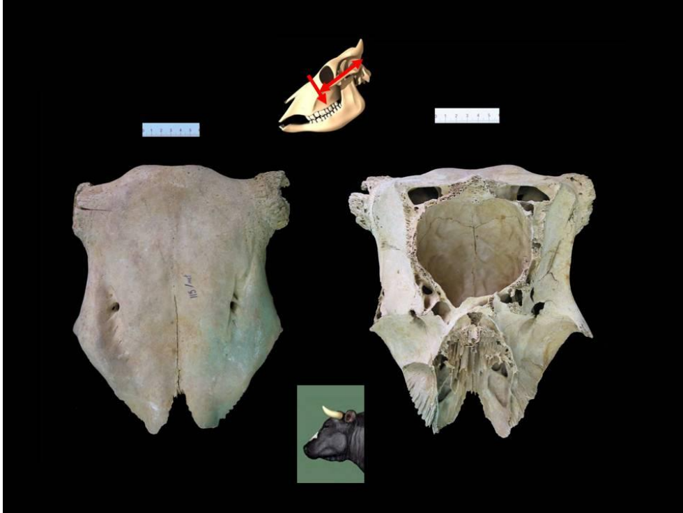
Figure 6. Slaughter marks on the bull's skull unearthed from the Metro and Marmaray excavations.

looked after well. We found, for example, widespread backbone deformations that are attributable to a wrong riding practice, and damages to the animals' jaws as a result of wrong bridle bit applications. These findings provide important clues to the way horses were kept and treated.