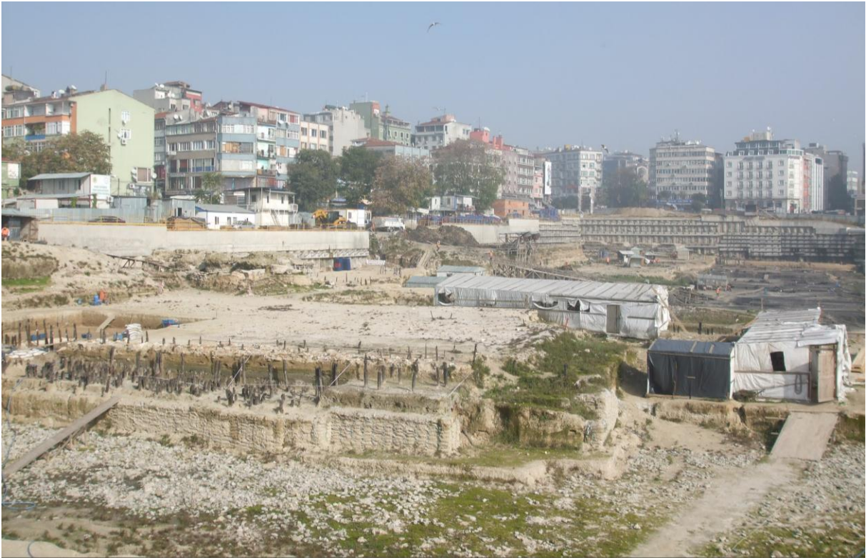
Figure 1. View of Yenikapı excavation area.

early as 2004 (Figure 1) with the permission of the Ministry of Culture, General Directorate of Cultural Heritage and Museums, and under the guidance of the Archaeological Museum. The excavation area of 58000 m 2 covers two different project areas - Metro and Marmaray - without, however, being subject to any project-related limitations. While the work in the Marmaray area has been completed in 2010, work in the Metro area is still in progress.