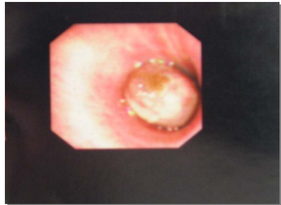
Figure 3. Fiberoptic bronchoscopy demonstrated a polypoid structure entirely obstructing the left main bronchus.

the lung was made. Immunohistochemistry showed strong positivity for cytokeratin 8/18 and beta-catenin. There was no reactivity for estrogen and progesterone receptors, CEA, alpha-feto protein, chromogranin A, NSE, p-53, and S100.