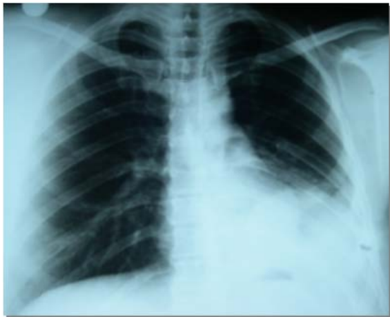
Figure 1. In chest x-ray; an opacity with well-defined border in the left lower lung.

Focal squamous metaplasia and a desmoplastic stroma with no immature cells were observed. Centrally, a squamous morule was present, composed of large squamoid cells with dense, eosinophilic cytoplasm and large round nuclei with pale chromatin and small but distinct nucleoli. The scant stroma was composed of bland spindle shaped fibroblasts. The definitive diagnosis of well-differentiated fetal adenocarcinoma of