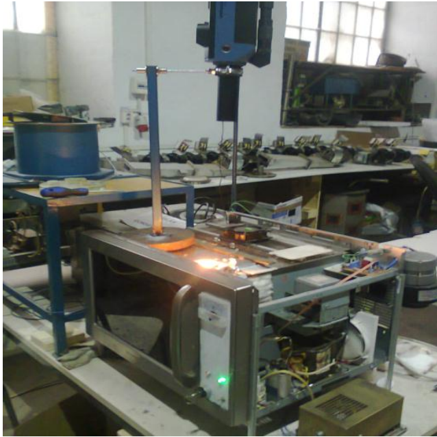
Figure 1. Adapted 0.8 kW domestic microwave oven

The 6 th variant was constituted based on the information provided by the literature [22], being used a mixture containing 62% colorless glass, 20% amber glass and 18% green glass.