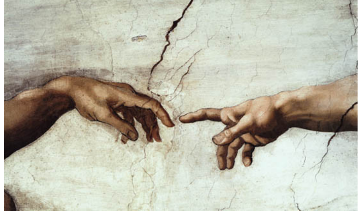
The Creation of Adam, Michelangelo

Besides this, the moment when E.T. touches Elliot’s index finger is another important one. Similarly, in “The Creation of Adam” by Michelangelo, God’s finger touches Adam’s. It takes place in the scene they overhear from behind a door the mother reading a bedtime story to the little girl. Elliot comes with a box full of items E.T. can use to communicate with his own planet. He touches a sharp object and his finger bleeds. E.T. touches his finger with his glowing finger and the cut disappears. There is very soft and calm music in the background, and as the voice-over, the story the mother reads her daughter is heard. The sound effect telling that the miracle has happened fades out while E.T.’s fingertip turns back to normal. This short plan was edited parallel to the mother and daughter’s reading a story in bed and is not very dramatic in visual aspect. However, when communication with an extra-terrestrial is in question, “The Creation of Adam” by Michelangelo comes to mind.