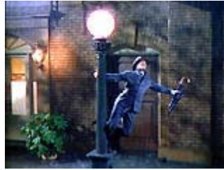
Singin' in the Rain