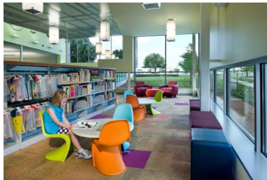
Image 3: Dallas Public Library Children's Room (Lockwood branch) All chairs of the study, rest furniture, windows and shelves of books and materials fits perfectly with the physical dimensions of children and parents waiting room is separate from this department. Reference: msrdesign.com

Architecture is necessary associated with the intake childish is in direct proportion. Requirements to ergonomics or physical characteristics of children interpreted, issues such as the physical scale of the child and what height the world and looks around. With the scale is designed to fit the child's sense of alienation and insecurity completely and totally space he sees his own. Of the most important cases which in accordance with the scale in their design to create a sense of security in the child can be to dining room and bedroom furniture and health services? Should strive be the size of a table and chairs, toy chests, door handles and valves height couches etc. designed to suit children's sense of security and belonging in his scale is created. (Picture 3)