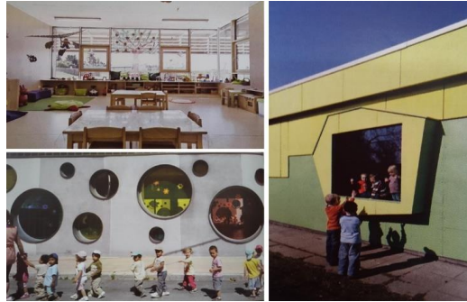
Figure 6: Typical communication between the external environment and the use of windows and large terraces, Reference: Azmoudeh: 2012