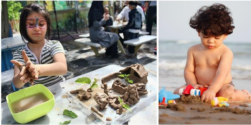
Image 1: The interest of the child to touch the water, soil and plasticity of the first months of life and play with it without any legal rule and maintain this interest with age but with a meaningful purpose and design.

In general, children's games are along with gusto and enthusiasm and with a smile and leads to not isolation of children in the community. If children play in the natural environment and nature made the greatest impact on the growth of the child because he loves nature, trees, animals, birds, and soil and water the most. (Picture 1) In terms Jean-Jacques education should be child's normal growth and development during the streaming server and a good teacher to his nature and nature as far as possible to the child's release. (Shia, 64: 2006)