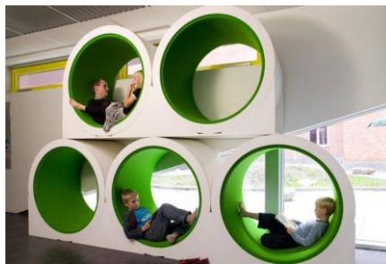
Figure 4: Private and cozy atmosphere and attractive for children. Reference tapja.com