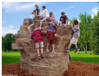
Figure 7: create interesting and complex topography for adventure. Reference: ketabak.org