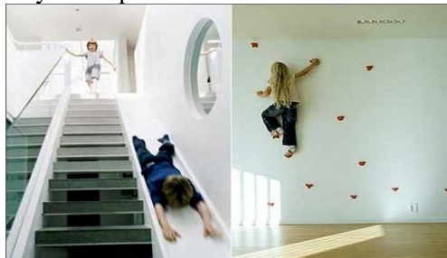
Figure 5: Create a new and interesting way to move in height.