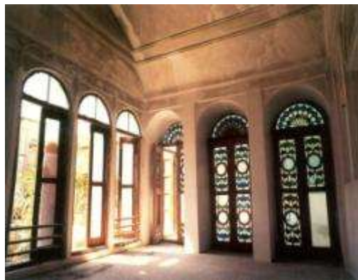
Picture 8. Decorations of the door in Alireza Arab's house (Haji Ghasemi, 1378).

Harmony with environment is not only in view but also is in function too. When the one of the Orossi, is in adaption with its surrounding parts in Arabha's house, plans and walls and orossi and material are in harmony with the environment like the other two houses. Another aspect of life is growth(development)which means physical body possess life and like live creatures .it has the capacity of growth. The growth is not physio-biologic development but structural as physical body starts from a module and grows and develops until the whole structure is produced. This feature is seen in house plans, where are Iranian architecture house elements like surround yard and front yard, yard and garden, corridor, hashti and so on are arranged based on modules. This module has developed in the plan and turned from component to whole. In Alireza Arab's house, karbandi module has developed from small to big. In fact a seed has grown to a big house.