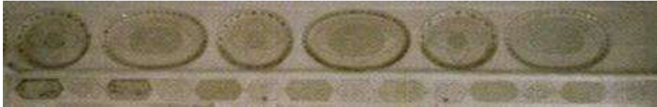
Picture 3. Room decorations of Arab Kermani's house (Haji Ghasemi, 1378).

Yard in general has its own nature, which is created by putting some parts together. Like mud brick, walls plaster with cob that are put together and provide their own substantial nature. Besides regarding various size and scales; square bricks with rectangular pool and garden have made up of the whole yard.