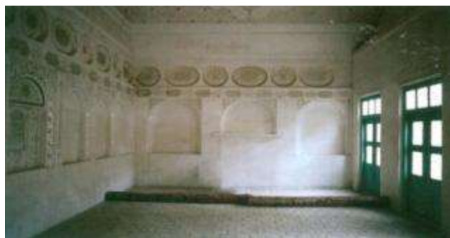
Picture 6. The northeast room in the small yard of Arab Kermani's house (Haji, Ghasemi, 1378).

This aspect is found in each one of the components, both in geometry of plan and in elevation where squares and rectangles are put together in a harmony and made up the general rectangle space. Such environmental adaptability is obviously seen in the interior side of room walls in Arab Kermani's house, where plaster walls have some designs that are completed together as a whole and mirror decorations are placed inside plaster or where white, silver and green colors are put on plaster; however, adapted to it, mirror segments are set on plaster in harmony in design, geometry, color and material.