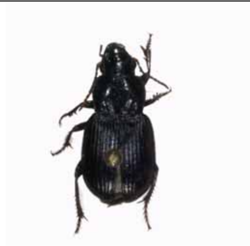
Harpalus (Harpalus) metallinus Ménétriés, 1836