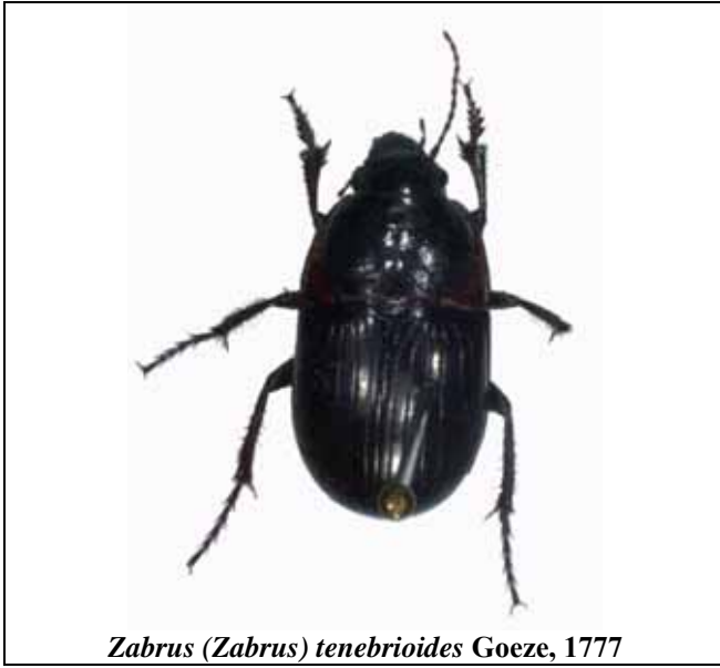
Figure 2. Habitus of the species recorded Şekil 2. Tespit edilen örnekleri habitus görüntüleri

All of the species, except for Zabrus corpulentus , are new record for the local fauna of the province Balıkesir. The specialists stated that pitfall trap is the most useful and common method for collecting Carabidae samples. Pitfall trap provide to get more specimen and species, especially the nocturnal ones. In our study the samples were collected with aspirator and hand in the daytime, because of that we could collected some of the daily active (=diurnal) species. So we think that low number of species in our study depends on sampling method. However, our results constitute a preliminary information about Carabidae fauna of the region. We hope that this preliminary work would be useful for further studies that will be performed on ground beetle fauna of this area.