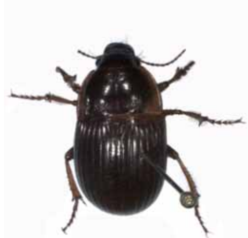
Zabrus (Pelor) corpulentus Schaum, 1864