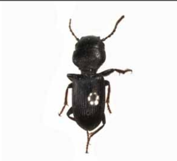
Dixus eremita (Dejean, 1825)