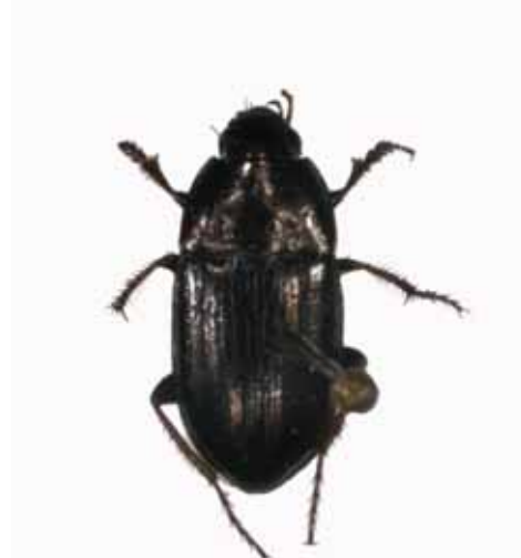
Amara (Amara) aenea (De Geer, 1774)