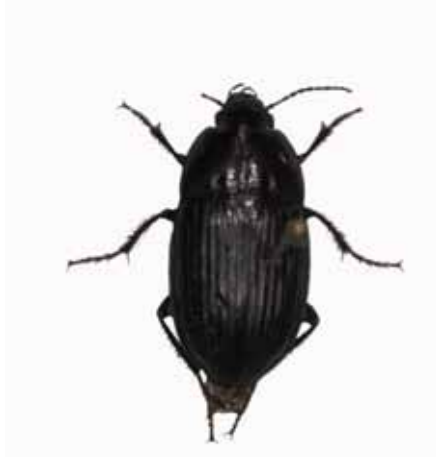
Amara (Amara) eurynota (Panzer, 1796)