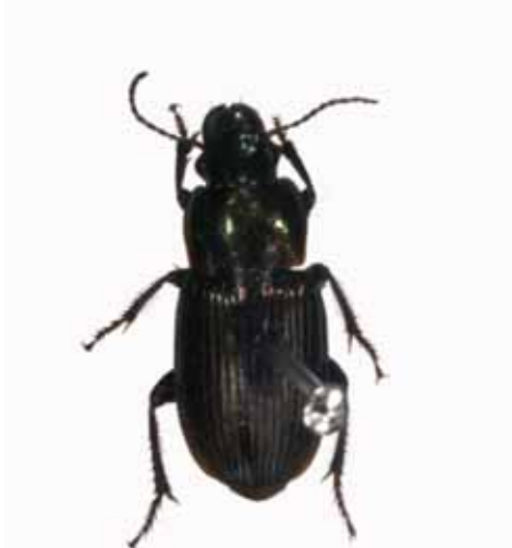
Harpalus (Harpalus) distinguendus distinguendus (Duftschmid, 1812)