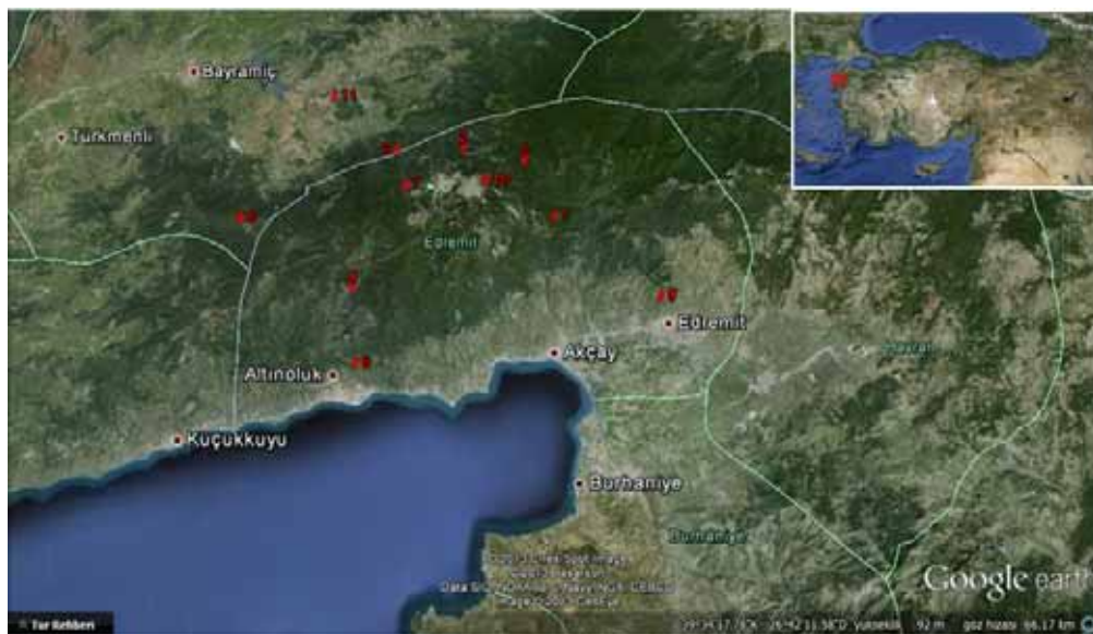
Figure 1. Map of study area