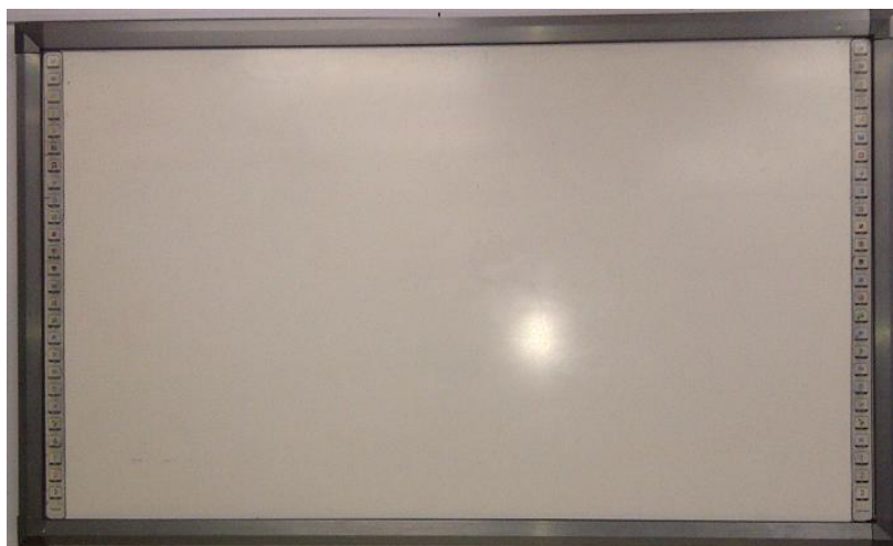
Figure 2. An IWB Available in the Classroom (Type: Ketab)

The collected data were analyzed qualitatively, organized into binders based on their themes. Documents were compared with teachers' responses to the interview questions. The field notes were detected to know about IWBs' positions and types in classrooms. The researchers took a picture for the available IWBs. Figure 2 shows the picture of an existing IWB.