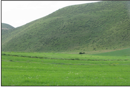
Figure 2. Community of Cotonoaster nummularia Fisch. & C. A. Mey.

Salix caprea community develops in some places along side Kocasu stream, around Balkaya village and in the N of Hasanpaşa village in streambed and in 30 ha humidity area of SE of Laladağ village in the study area. S. alba community is available in the area in tree form approximately 40-50 m in length and in shrub form in Kocasu streamside. Populus tremula , Cerasus mahaleb var. mahaleb , Rhamnus catharticus var. catharticus , Salix caprea , S. alba , Rosa pisiformis and R. canina shrub forms are observed in the slopes of stream in the S of Kardeşler village.