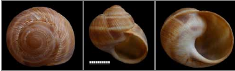
Figure 1. H. (Pelasga) pathetica . (Scale 1 cm).

Genitals (Figure 2a, b, c): According to Hesse (1920), albumen gland yellowish in color and very voluminous, connecting to sperm-oviduct at its wider base; hermaphroditic gland brownish and coiled; bursa copulatrix sac oval-like and diverticulum spindle-shaped or club-shaped and short; at its base, bursa copulatrix duct thick and broad; common duct of bursa copulatrix and diverticulum more pronounced than bursa duct; dart sac club-shaped, located on about middle of vagina; from the base of dart sac, mucus glands stemmed and branched off numerous branches and mucus glands broom-shaped; the point where connects penial retractor muscle thin; short and a bit bulge between this point and vas deferense; flagellum length being some thick at its proximal part more than twice total length of epiphallus and penis.