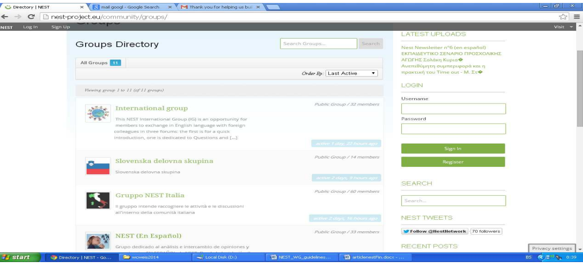
Fig. 2: NEST groups

During the project life the NESt platform has been carefully tested and used by several users from participating countries.