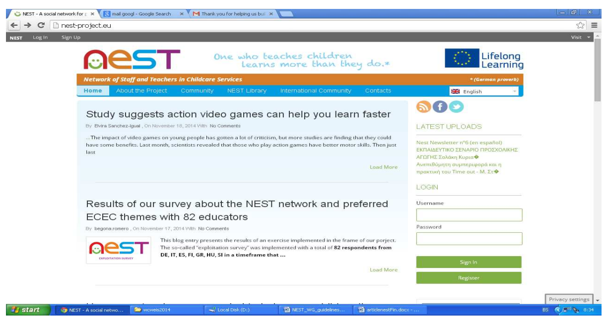
Fig. 1: NEST project

If the user wants to participate actively in groups and not only to read materials it has to register. The registration process is simple and easy to realize.