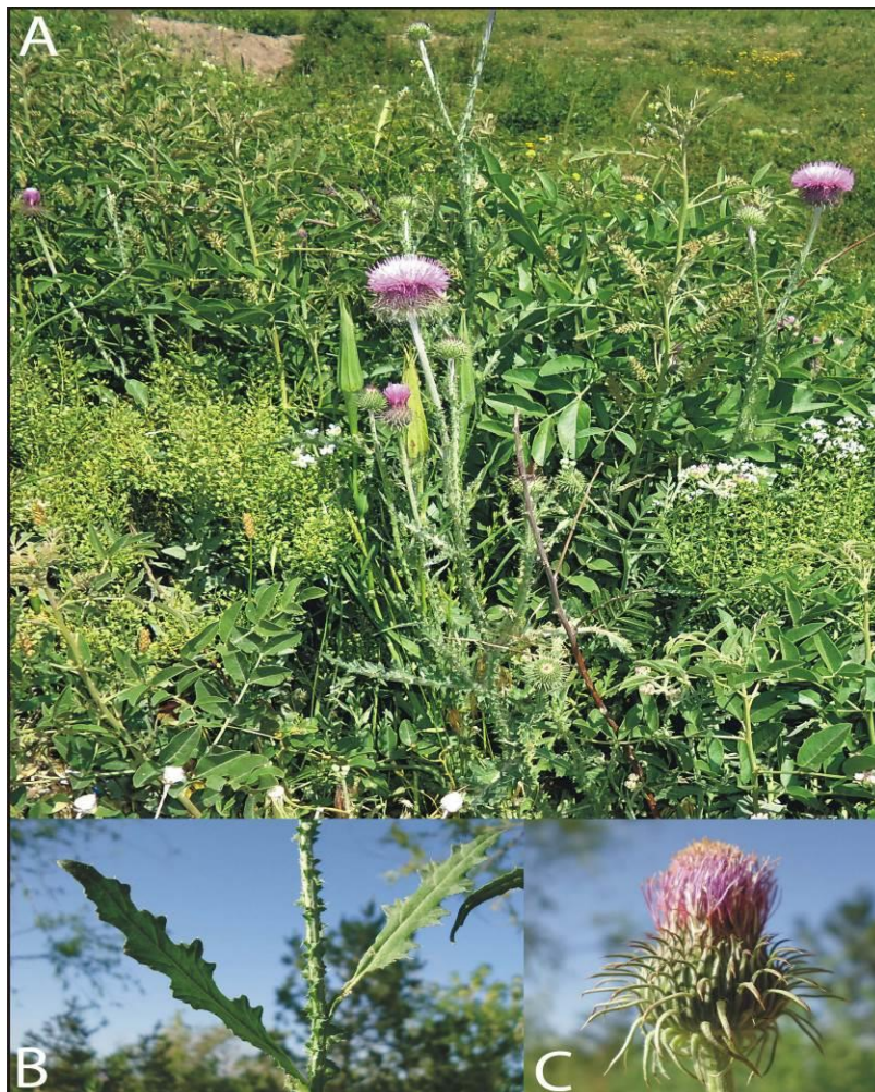
Figure 2. Carduus transcaspicus subsp. macrocephalus . A – habit, B – median cauline leaf, C – capitulum

C. uncinatus M. Bieb. subsp. transcaspicus Rech. f., in Ann. Naturh. Mus. Wien 54: 15 (1944) non C. transcaspicus Gandog.