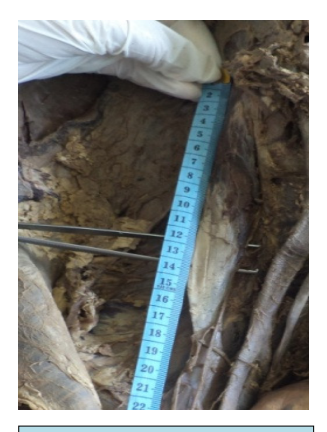
Figure 2: Measuring the total length of the muscle by using a tape measure.

Figure 1: showing bilateral presence of psoas minor muscle,1.Rt psoas minor muscle(belly),2.Rt psoas minor muscle (tendon),3.tendinoaponeurotic part of Rt psoas minor muscle,4.Rt psoas major muscle,5.Rt genito-femoral nerve,6.Rt external iliac artery,7.Rt kidney,8.Rt ureter,9.Lt psoas minor muscle(belly),10.Lt psoas minor muscle (tendon).Rt-right,Lt-left.