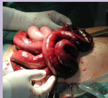
Fig. 4 : Gangrene of ileum