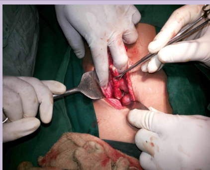
Fig. 1 : Acute appendicitis

This table shows distribution of postoperative complications. 14 patients have surgical site infection (SSI), 7 patients have multiorgan dysfunction syndrome (MODS), 1 patient have myocardial infarction (MI) and 2 patients have acute renal failure (ARF).