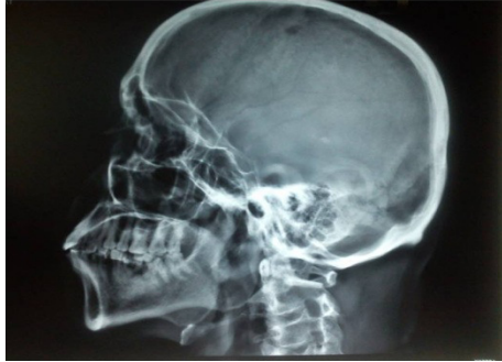
Radiograph of lateral view of Skull showing osteolytic lesions.