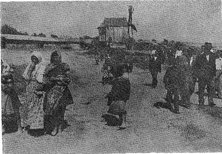
Figure 3. The girls promenading at the mill, cracking sunflower seeds.

day. Smoking was prohibited. Among them there was just one man who smoked a pipe. He was a deviant character, yet was tolerated by his group because he acted as mediator between the patrons of fisheries and the village labourers for the gurbet season. On festive occasions like weddings or holidays, all the inhabitants of the village invariably overdrank. Even the babushkas (old women) of the village were tipsy and joined the dancing on the streets and merry-making. I know, for I was urged to join them as their friend, kumak several times during their weddings, an obligation and honour which no kumak and later on a «special matron» ( sagdich ) at a wedding had a right to refuse. The weddings usually took place after the harvest and lasted for three days. It was a very festive occasion more or less the whole village taking part in the festivities. The wedding festivities started after the church ceremony which was very long, full of rituals and very complicated. The first evening after the ceremony a banquet was given in the bride's home to the womenfolk of the bridegroom. On the second day a banquet was given to the mem-