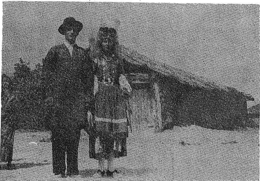
Figure 4. A newly wed Cossack couple.

Actually, it is scenes from everyday life and Tolstoy's artistic rendering of them that fills one with a sense of déjà-vu rather than historical facts or quantitative data about these people.