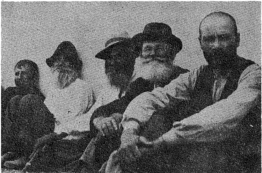
Figure 5. Old Cossacks of Kocagöl.

The next day was a holiday. In the evening all the villagers, their holiday clothes shining in the sunset, were out in the street. That season more wine than usual had been produced and the people were now free from their labours. In a month the Cossacks were to start on a campaign and in many families preparations were being made for weddings. Most of the people were standing in the square in front of the Cossack government Office and near the two shops, in one of which cakes and pumpkin seeds were sold, in the other kerchiefs and cotton prints. On the earth embankment of the office-building sat or stood the