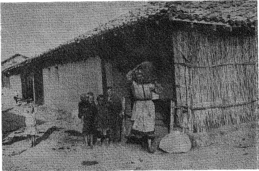
Figure 2. Woman with a heavy burden on her shoulder.

The choice of the setting of the village of Manyas Cossacks by the Lake was, of course, not accidental since these Cossacks just like the Terek Cossacks depended on agriculture, as well as fishing for their livelihood. Most of the families owned farms of from about 15 - 20 acres up to a thousand acre. They also owned herds of cattle and grazed them on the common pasture of the village. They mostly grew beans, maize, millet and sunflowers. In the gardens all sorts of vegetables, fruits, vines, watermelons, melons and pumpkins are grown. Mostly women worked in the fields and the gardens, whereas