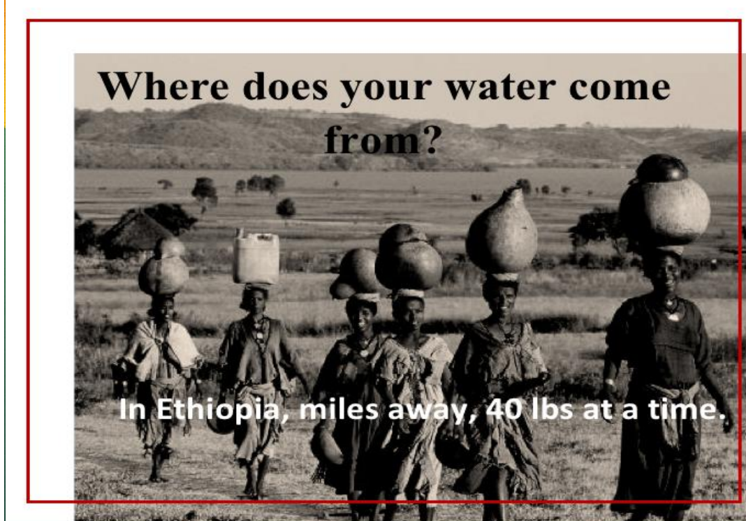
Figure 1. Student Poster of the Water Project, modified from Water Encyclopedia [Photograph] (2010)