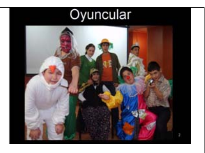
Figure 3. A screen image of the video, The King And The Theatre