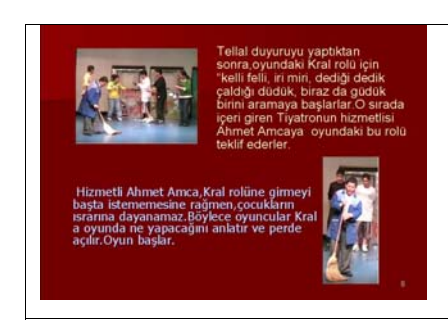
Figure 1. A screen image of the ELVES presentation

Neither the video-educated students or those experiencing the computer-aided ELVES method had ever read the text of The King and the Theatre or seen its theatre adaptation. In order to induce the children to follow the educational methods carefully, we had the teachers distribute a video-watching form to the video-educated children and a presentation follow-up form to those who took part in the ELVES method and ask them to fill them in during the session.