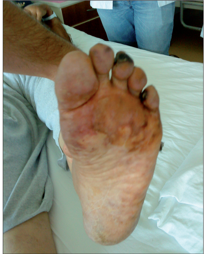
Figure 2: Cyanotic fingers of the right foot, the 1st and 5th distal phalanx view necrotic.

Neutrophil 80%, lymphocyte 13.2%, monocyte 4.07, eosinophil 1%, Sedimentation 34 mm/h, TSH 2.4 mIU/L, C3 69.7 mg/dl, and C4 22.1 mg/dl.