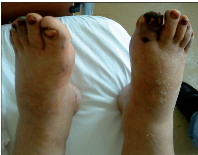
Figure 1: Bilateral toes were cyanotic, the 1st and 5th distal phalanges of the right foot and the 3rd and 5th distal phalanges of the left foot were necrotic.