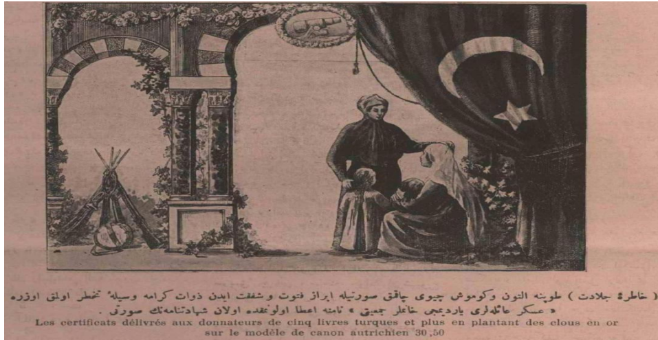
Figure 1 An example of the certificate handed to those who had driven a silver or golden nail into the cannon. Servet-i Fünûn , 1299, 28 Nisan 1332 (11 May 1916), coverpage. Note the canon in the medallion on the top center.

Hungary, but also to Germany and other countries, including the Ottoman Empire. 66 In November 1915 the women of the Asker Ailelerine Yardımcı Hanımlar Cemiyeti asked for permission to place a wooden cannon on a central location in the city “in which persons, against payment of a certain sum, could hit an iron nail until the whole cannon would be covered by iron”. 67 Enver Pasha obviously liked the idea and gave his permission. It took some time for the cannon to arrive from Austria, but when it arrived it was placed at the Beyazıt Square, a central location in old Istanbul in front of the Ministry of War. The original idea had changed somewhat: anyone who wanted could still hit a nail into the wood against payment. Those interested, however, could choose between different nails, each with their own price: a gold nail costing five Turkish lira, a silver one one Turkish lira and an iron one one kuruş. The contributors were rewarded with a certificate and a gilded, silvered or tin rosette, respectively. 68