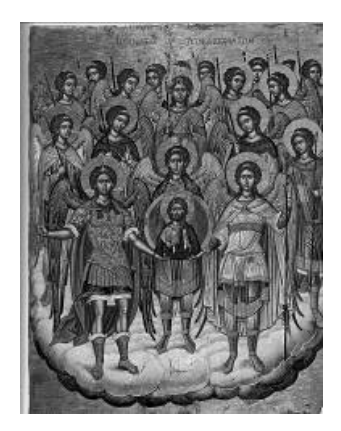
Figure 15. Synaxis of Archangels, Emmanuel Tzanes, 1666, Byzantine Museum, Athens