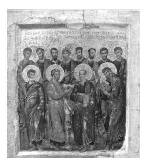
Figure 2 Synaxis of Apostle, Constantinople, first half of the 14th Century, State Pushkin Museum of Fine Arts, Moscow

4), the Virgin Mary as Zoodochos Pege or St. John the Baptist as Angel in the Wilderness. Mosaic icons of the period also show different exquisite craftsmanship.<sup>3</sup> (Fig. 5) A painterly and narrating character is observed in the painting from the second half of the 13<sup>th</sup> century onward. The colour palette expands and compositions reveal rich colour combinations. Architecture and landscape are accentuated and make up an intrinsic part of the compositions. Some stylistic features are as follows: voluminous figures with small heads, expressive facial gestures, hovering garments, which give ultimately the impression of a boneless sweeping body.<sup>4</sup> (Figs. 1, 2 and 3).