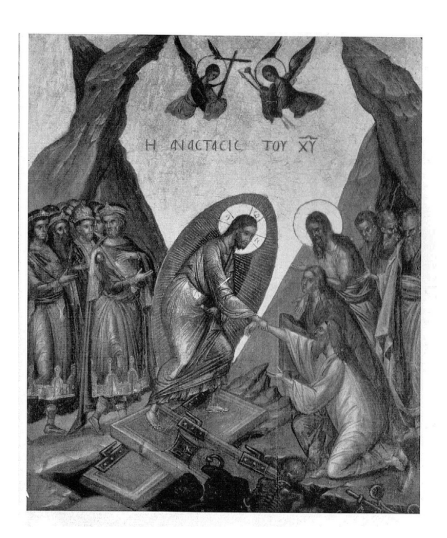
Figure 13. Anastasis, 16<sup>th</sup> Century, by Michael Damaskinos Hellenic Institute, Venice