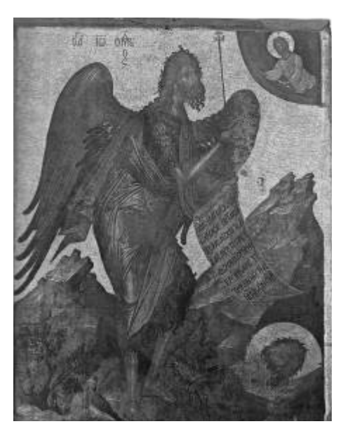
Figure 7. The Winged St. John the Baptist, by Angelos, Mid-15th century, Byzantine Museum, Athens

Nikolas Philanthropenos (active in 1375-1440), born in Constantinople, worked as mentor on the island in Heraklion. Andreas Ritzos<sup>11</sup> (Fig. 11) (active in 1451-1492) belonged to a painters-family and from 1420 until 1571 the three generations took