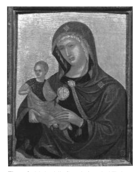
Figure 8. Madre della Consolazione, by Nikolaos Tzafouris, second half of the 15th Century Paulos Kanellopoulos, Collection, Athens

3. the use of parallel fine white lines, particularly on faces. (Fig. 6)