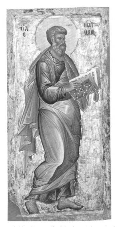
Figure 3. The Evangelist Matthew, Thessalonica or Ochrid, ca. 1295, Icon Gallery, Ochrid, FYR-Macedonia