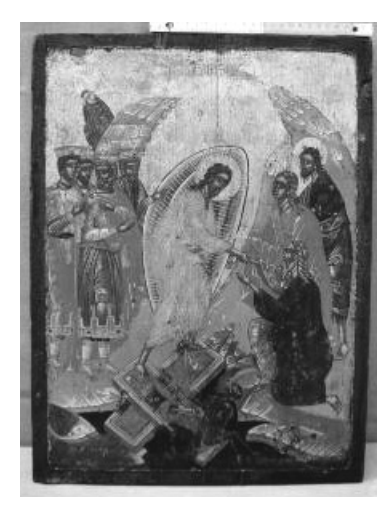
Figure 14. Anastasis , Inv. No. 34.2.82, Museum, Antalya