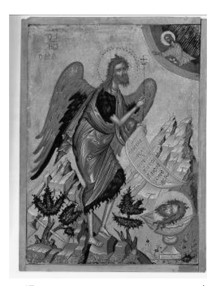
Figure 17. The Winged St. John the Baptist, 16<sup>th</sup> century, Hermitage Museum, St. Petersburg