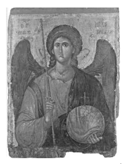
Figure 1. Archangel Michael, first half of the 14<sup>th</sup> century, Byzantine Museum, Athens