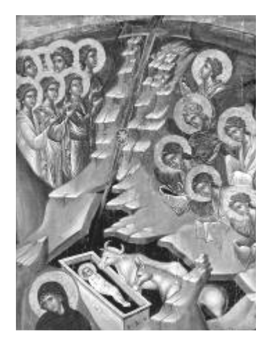
Detail, Figure 6