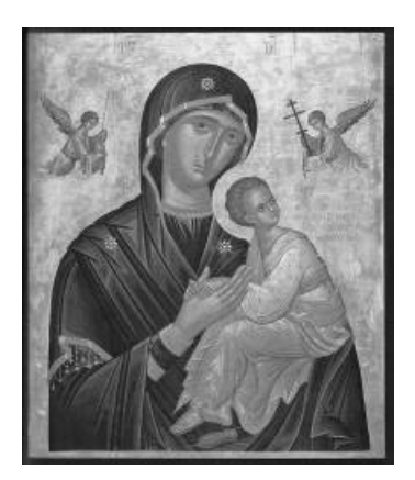
Figure 11. Apostles Peter and Paul, 16th Century, by Michael Damaskinos, Hellenic Institute, Venice

iconographical type of the Virgin appears to have been established after the middle of the 15<sup>th</sup> century, and possibly by the Cretan painter Nikolaos Tzafouris. (Fig. 8) During the second half of the 15<sup>th</sup> century, popularity and demand of icons painted in maniera greca increased. The clients were mainly from Crete, Venice and from elsewhere in Europe.<sup>14</sup> In the 16<sup>th</sup> century, Greek-Orthodox monasteries undertook significant renovation- and restoration programs and in order to pursue these vast projects artists i.e. painters were employed.<sup>15</sup> An example is the Cretan monk Theophanes Strelitzas<sup>16</sup> (died in 1559), who carried out the wall paintings of the church of Hagios Nikolaos Anapafsas, on Meteora in ca. 1520, he later contributed to the painting of frescos of the Stavronikita monastery, on Mount Athos, (1527-1558) and of the Great Lavra. He painted also at least twelve icons for the renovated iconostasis.