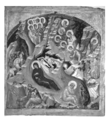
Figure 6. The Nativity, 15th century, former Volpi collection (no. 62), Peratikos collection, London

The Italo-Cretan Religious Painting and The Byzantine-Palaeologan Legacy