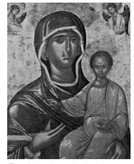
Figure 9. Mary Hodegetria with adoring angels, 16th Century, by Michael Damaskenos, Hellenic Institute, Venice

Iconographically, they depended upon the Italian models and patterns to certain extent as in the case of Madre della Consolazione , witnessed since the 1500s.<sup>13</sup> This