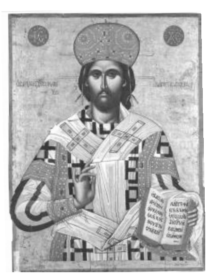
Figure 4. Christ as High Priest, Second half of the 17th Century, Historical Museum, Moscow (Photo after: Chatzidakis, M. 1993, fig. 57)