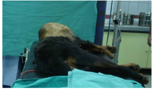
Figure 2. Fluctuant mass about the size of a soccer ball was observed including the right shoulder and neck region.

Şekil 1. Sağ omuz bölgesi ve boyunda şişkinlik.