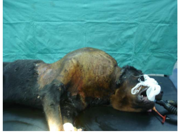
Figure 1. Swelling in the right shoulder joint and neck.

On examination a fluctuant mass about the size of a soccer ball was observed including the right shoulder and neck region (Figures 1, 2). It was reported that the general welfare of the patient gradually deteriorated and it could hardly walk. It was also reported that treatment of hematoma had been performed on the mass for 4 weeks. When the drain was controlled, drainage of fluid containing blood was observed. Anemia and leucocytosis was determined on examination of the blood. A date for operation was determined for extirpation of the mass or amputation of the extremity. Fol-