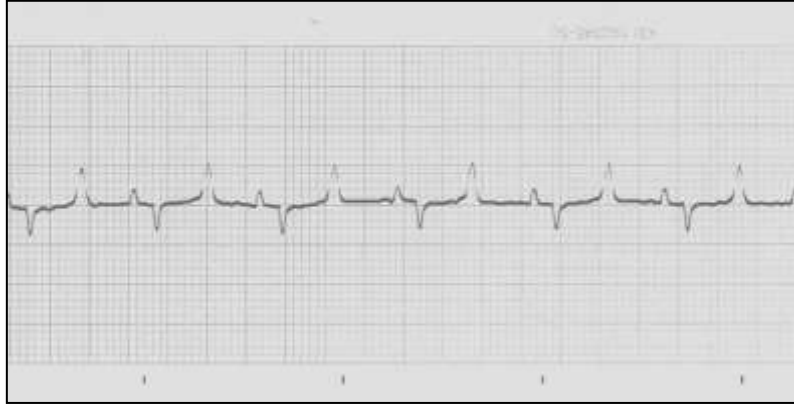
Figure 3. Horizontal ST-segment in electrocardiogram tracing from a 5 year old apparently healthy Holstein cattle (base apex lead, paper speed 25 mm/sec, sensitivity 10 mm/mV).

Şekil 3. 5 yaşında sağlıklı olarak gözlenen bir Siyah Alaca sığırdan çekilen elektrokardiyogramda horizontal ST segmenti (base apeks derivasyonu, kağıt hızı 25mm/sn, hassasiyet 10mm/mV).