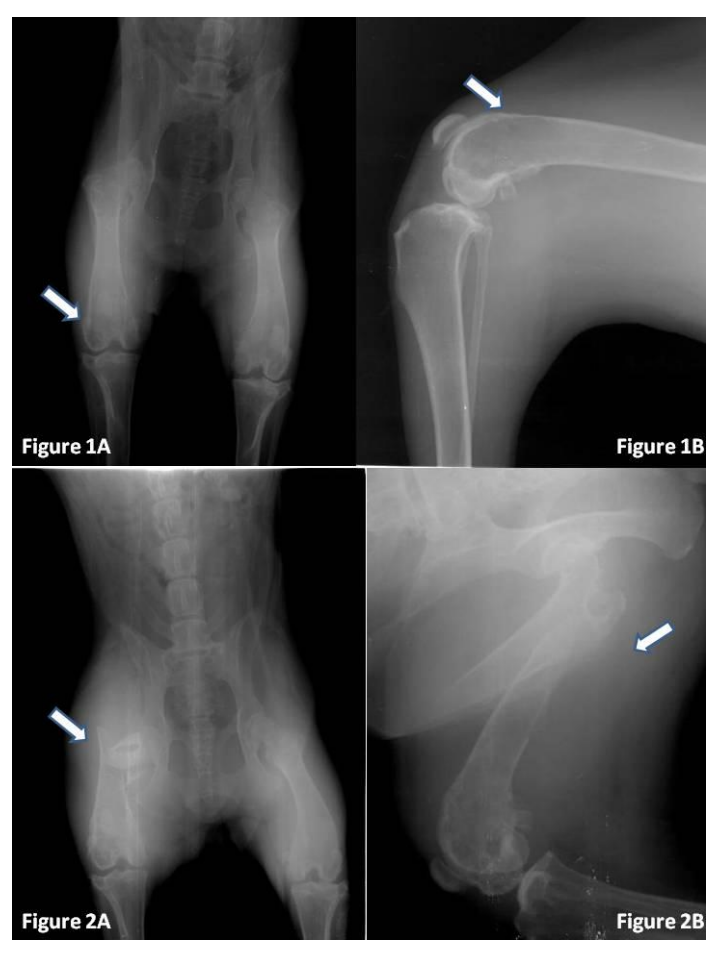
Figure 1A, 1B. Radiological assessments of the case: Osteophytes and osteoporotic areas in the distal part of femur (during the first examination).

Şekil 1A, 1B. Vakanın radyolojik değerlendirmesi: femur distalinde osteofitik ve osteoporotic alanlar (ilk muayene sırasında).