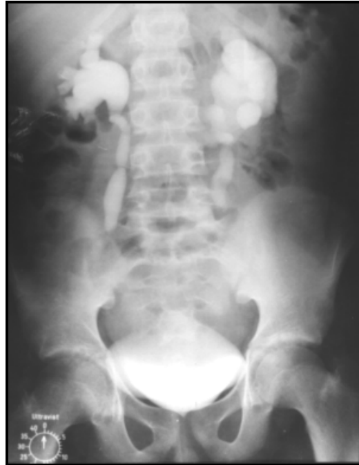
Figure 1. IVP demonstrating a silhouette of pelvic mass compressing the bladder and lower parts of the ureters resulting bilateral hydronephrosis.

Appendiceal abscess is usually seen in the pediatric patients. It has been reported that urinary symptoms appear after intestinal symptoms and they may even mislead the physician to a misdiagnosis of a urological disease. 1 In our case, the patient had no abdominal symptoms except for an abdominal pain radiating from the left lumbar region. The complaint of urinary frequency had also