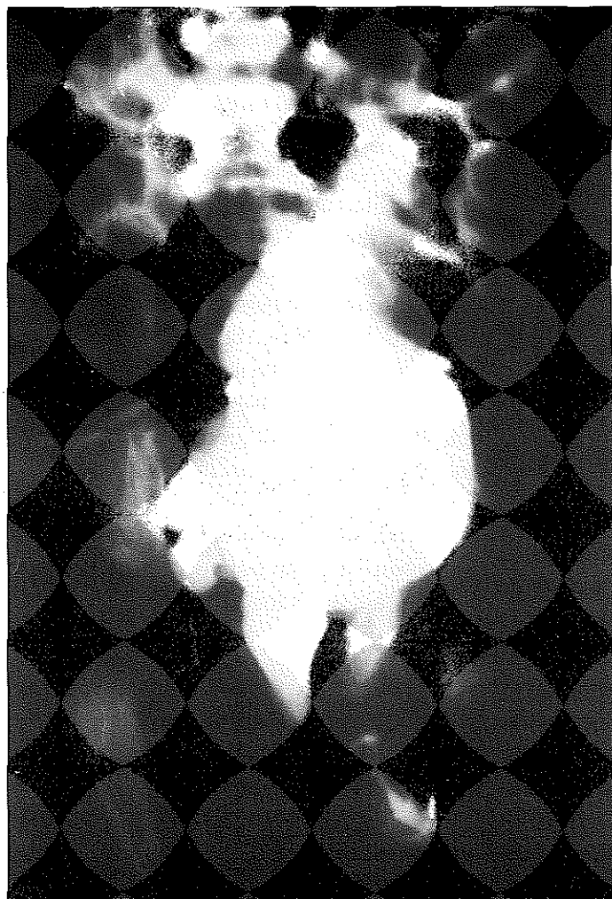
Fig. 1. Voiding cystourethrogram demonstrating posterior urethral dilatation and disturbed bladder

control urine cultures became sterile and his serum creatinin level increased to 2.8 mg/dl. At the 25th day of life endoscopic urethral valve resection was performed and urine passage was maintained through a urethral catheter for 7 days. Repeated voiding cystourethrogram showed disappearance of urethral dilatation (Figure 2). Urethral catheter was removed during follow up period and normal urinary passage was achieved. At the 36th day the child was found to have restlessness, poor feeding and vomiting and ultrasound examination revealed left hydronephrosis and hyperechogenic renal opacities (fungal bezoars) in caliceal system. Meanwhile serum creatinin level increased