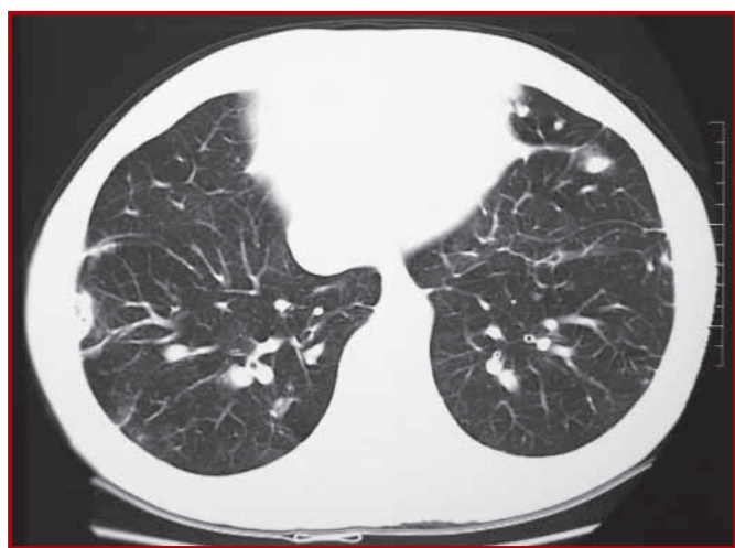
Figure 1. Computed tomography showed bilateral pulmonary multinodular lesions

Pulmonary hydatid cyst has no characteristic symptoms (2). The clinical manifestations depend on the site and size of the lesions, whether the cyst is intact or ruptured (2,10). For example small and peripherally located lesions are usually asymptomatic, but large central lesions may manifest with symptoms (3,6). Moreover, the clinical manifestations of pulmonary